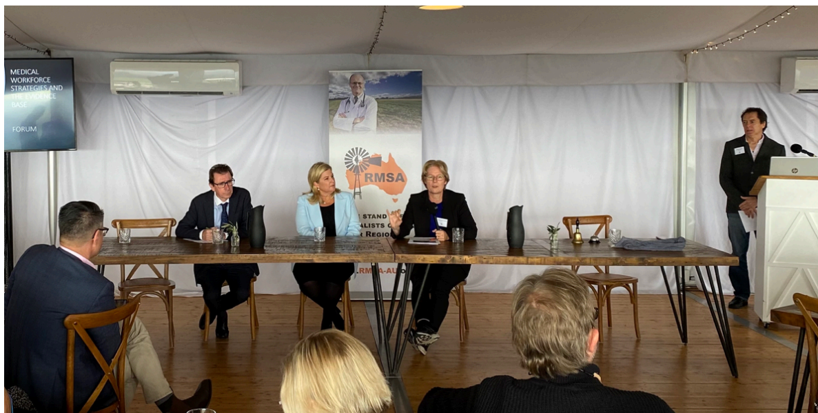
Plenary session from 2022 conference (Wagga Wagga)